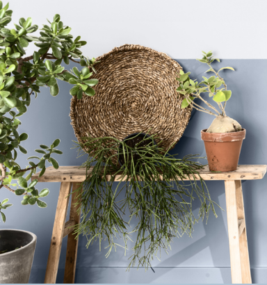
Blueberry Mash 14BB 55/113

Refreshing blues; these tones can make any room feel in touch with the natural world, helping to bring tranquillity into the home.